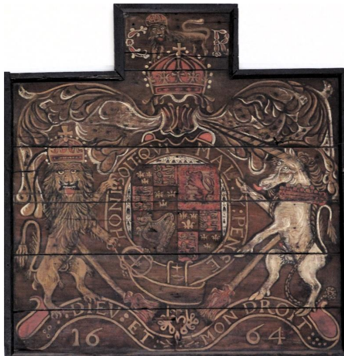
Royal Coat of Arms Charles The Second

Following the service you are invited to stay for tea and light refreshments.